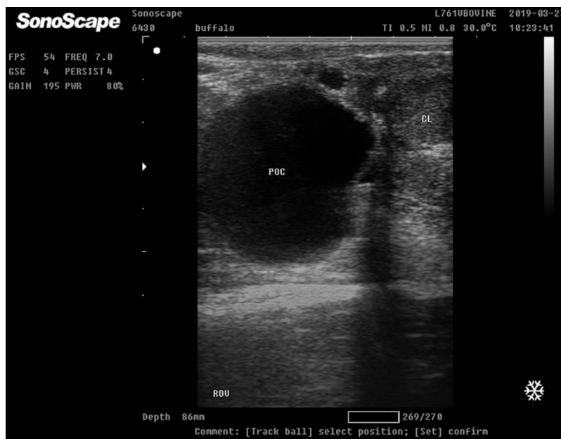
Fig. 1. Representative ultrasonogram of paraovarian cyst in buffalo heifer nearby the ovary that presented corpus luteum. Paraovarian cyst (POC) appeared as a large translucent anechoic cavity. The corpus luteum (CL) showed a varying degree of heterogeneity.

and pregnancy) is shown in (Table 2). Analysis of the obtained data revealed, as expected, that the paraovarian cysts size, follicular number ( P=0.845 ) and corpus luteum size ( P=0.161 ) were not statistically varied, although dominant follicle size tended to be significantly ( P=0.069 ) differed between groups.